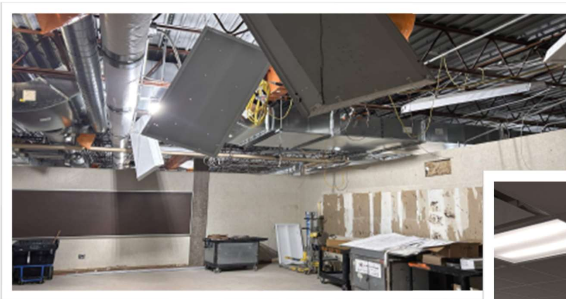
Phase 2a Classroom Remodel (fall 2023)