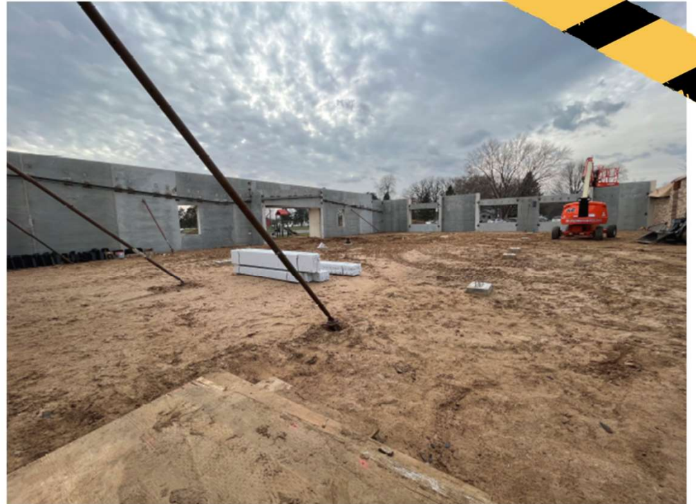
Inside of the Precast Addition