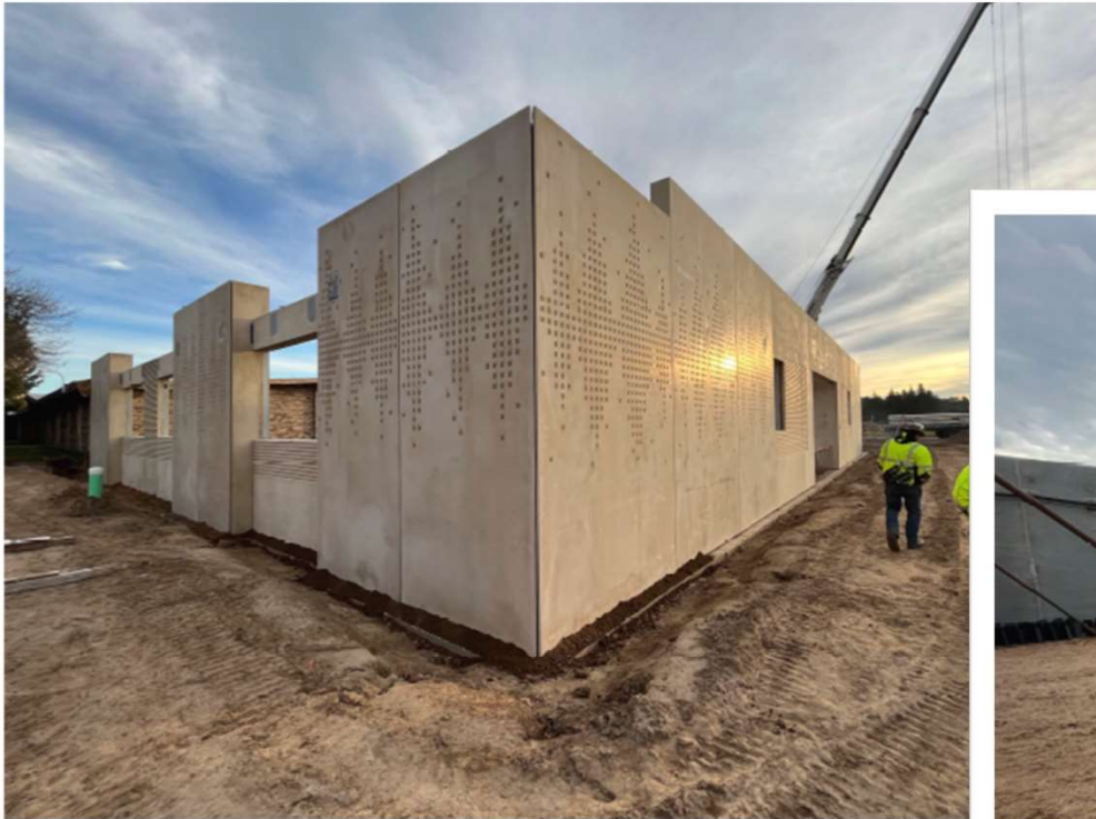
Precast Installation for the Addition