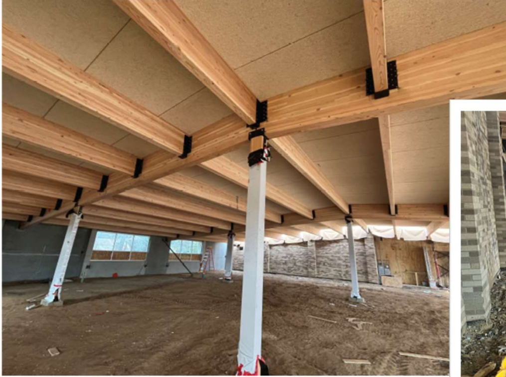
Installation of Glued-Laminated Beams, Columns, and Tectum Roof Deck