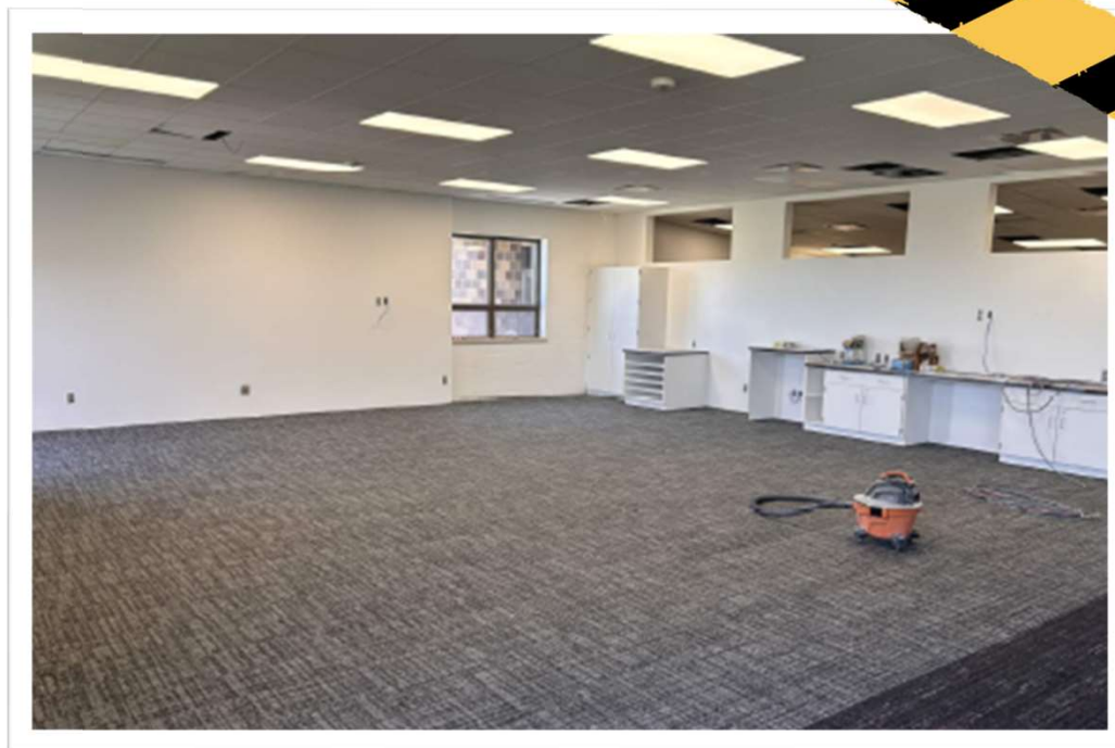
Almost Complete Media Center (summer 2023)