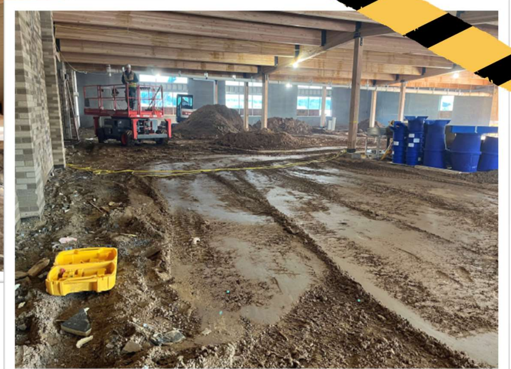
Prepping for Underground Ductwork